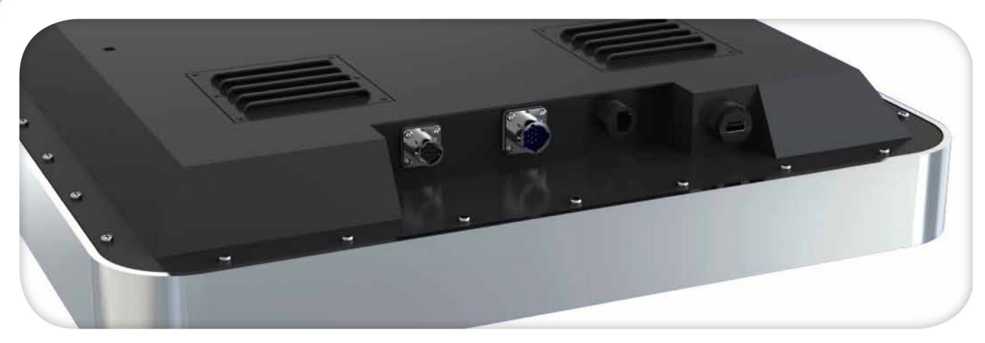
IP65 Rated Waterproof AV Inputs