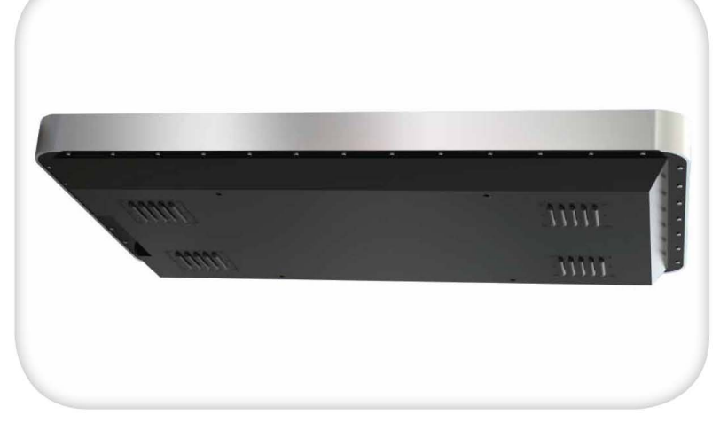
Product In Situ