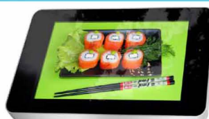
Anti Reflective Glass