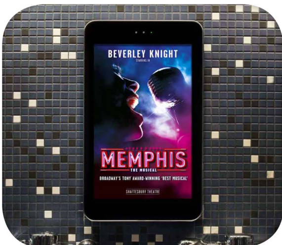
Product In Situ