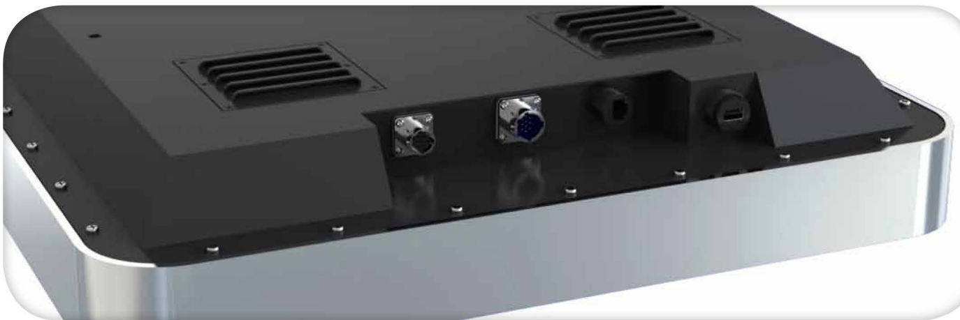
IP65 Rated Waterproof AV Inputs