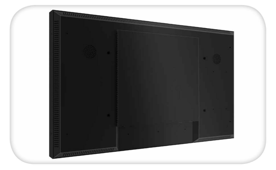
Audiovisual inputs and power input