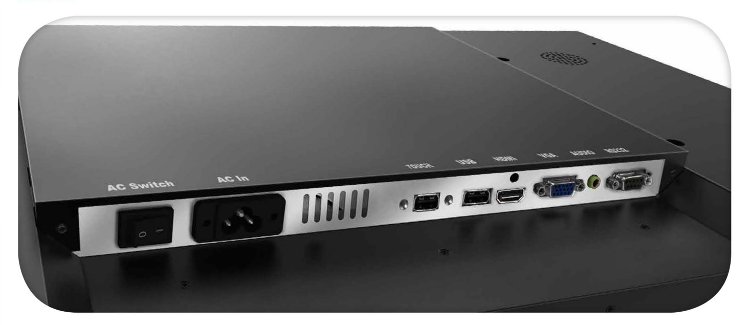
Audiovisual inputs and power input