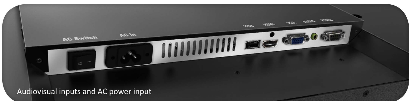
Audiovisual inputs and AC power input