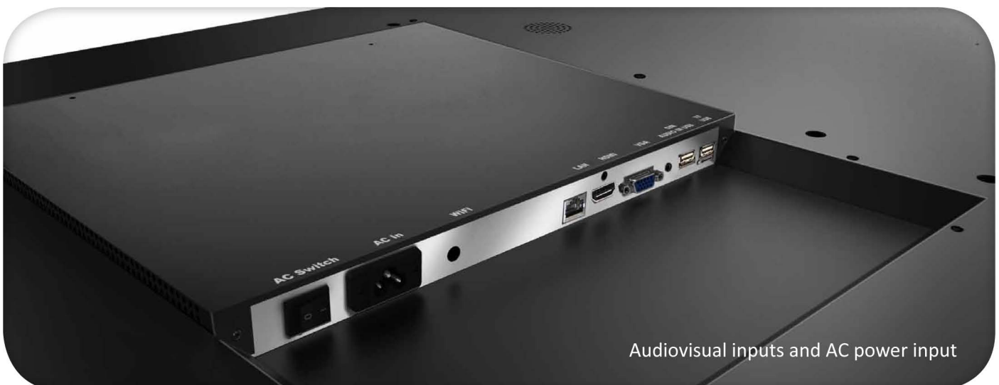
Audiovisual inputs and AC power input